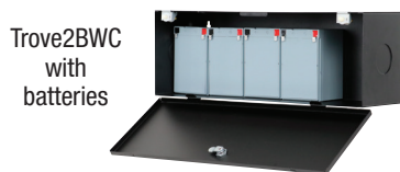
Trove2BWC with batteries

Altronix BR1 mounting bracket is compatible with Altronix Maximal and Trove enclosures. It allows to mount one (1) PD4UL(CB), PD8UL(CB), ACM4(CB), MOM5, VR6, PDS8, NetWay5B or LINQ8PD(CB) sub-assembly on the enclosure's inside wall, saving valuable space.