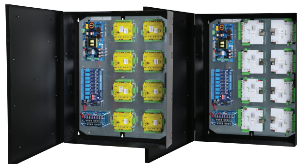
Trove2PX2 with eight (8) Net2 boards