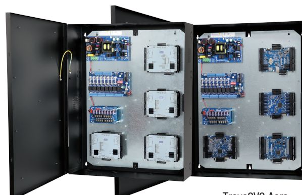
Trove2V2 - Aero modules with cases